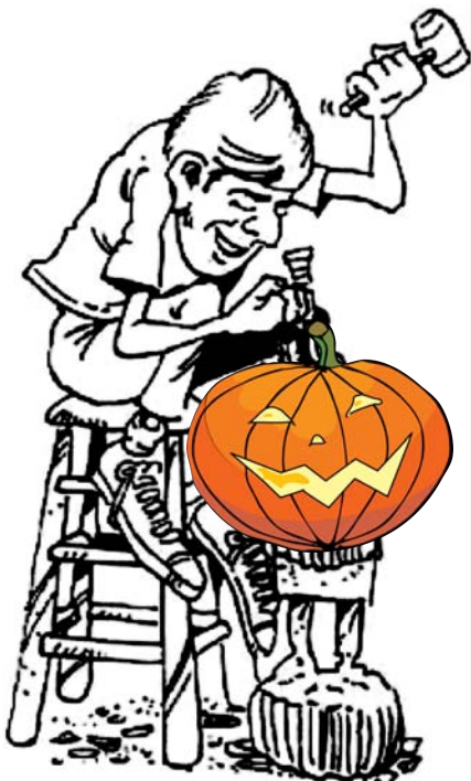
The Chippers Club logo:

Thank you to the 30+ members who have already paid their 2021-2022 dues.