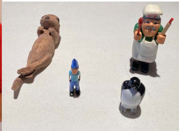
Irene Petrik uses her woodburning skills to make stable stall nameplates for horses.