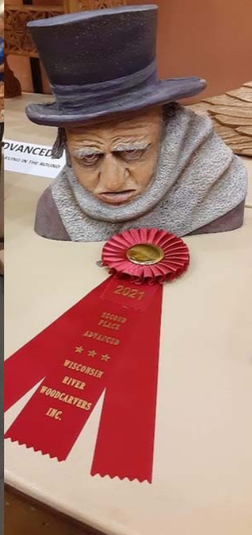
Ebenezzar Scrooge for parsimony. (Paul Wolters relief)