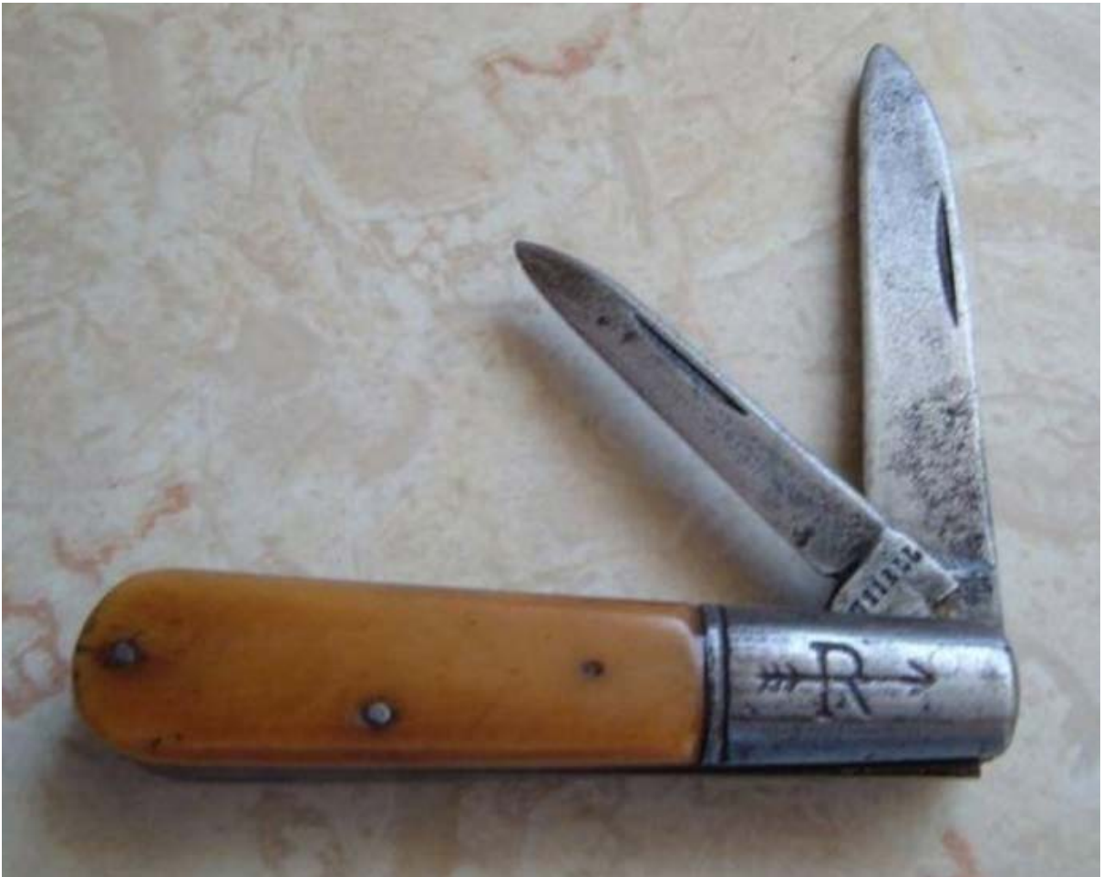
Russell Barlow knives 1884-1933

The Club sponsored class scholarships are back in place. The general rule is for Board approved courses, where the tuition (not materials) is $100 to $199, the MWC club has offered a $25 scholarship rebate after conclusion of the class for club members who pay for and attended the class. For classes having a tuition of $200 and higher a $50 scholarship rebate is offered.