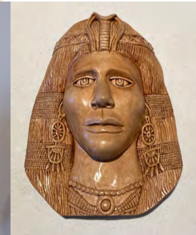
The Egyptian Princess was carved by Virginia Temme in basswood with a natural finish.