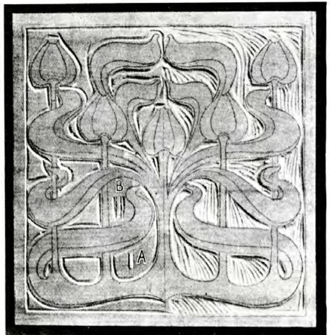
Fig. 143.—Left, V-tool Trench Work; Right, Wasting Away with Gouge.