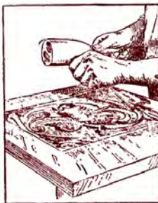
Figs. 1 and 2 at top; Figs. 3 and 4 below